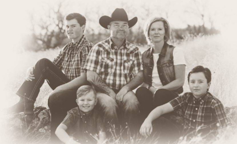
From all of us at Fladeland Livestock, we would like to welcome you to the 2022 bull sale.

Once again, we are partnering up with Twin View Livestock and together we are bringing you a solid set of bulls from both our programs with proven and new genetics.