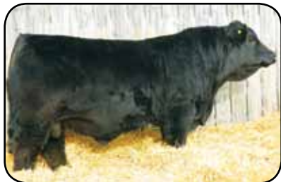
brother to dam