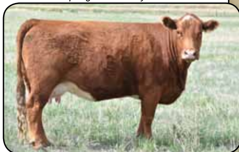
Springcreek Honey 909Y