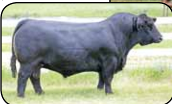
service sire NCB Cobra 47Y