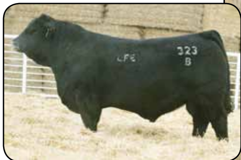
LFE The Riddler 323B