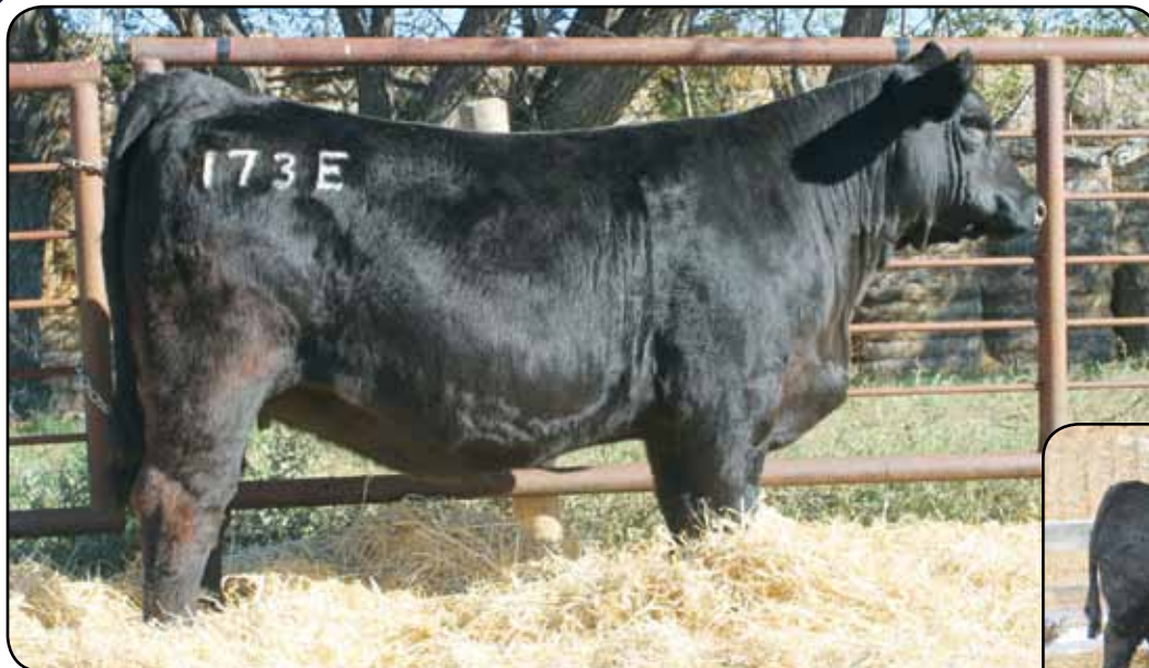
MRL Missile 138C