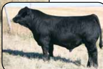
WHL Gold Key 1619D