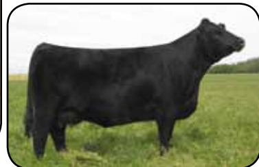
TLG Flirtin with You - dam of sire