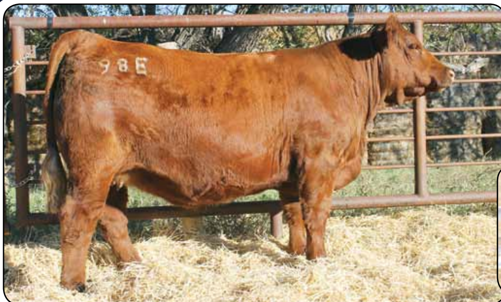
MRL Missile 138C