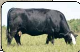
Springcreek Detroit 32W