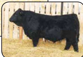
Skors High Roller 34C

An exciting Priority 3C daughter out of a very good Lotto cow that produced the $42,000 El Tigre son, IPU Resolve 114D, that sold in our 2017 bull sale to Deeg Simmentals and Muirhead Cattle Co. She again has a really good bull calf in our black pen this year. These Priority daughters are going to make exceptional cows. They're structurally very good, angular, good uddered and very eye appealing. This heifer has a lot going for her. She is homo polled by parentage, has a great set of EPDs (in the top 35% or better in 11 of 13 categories) and is bred to the calving ease bull, Skors High Roller 34C. This is definitely a brood cow in the making.