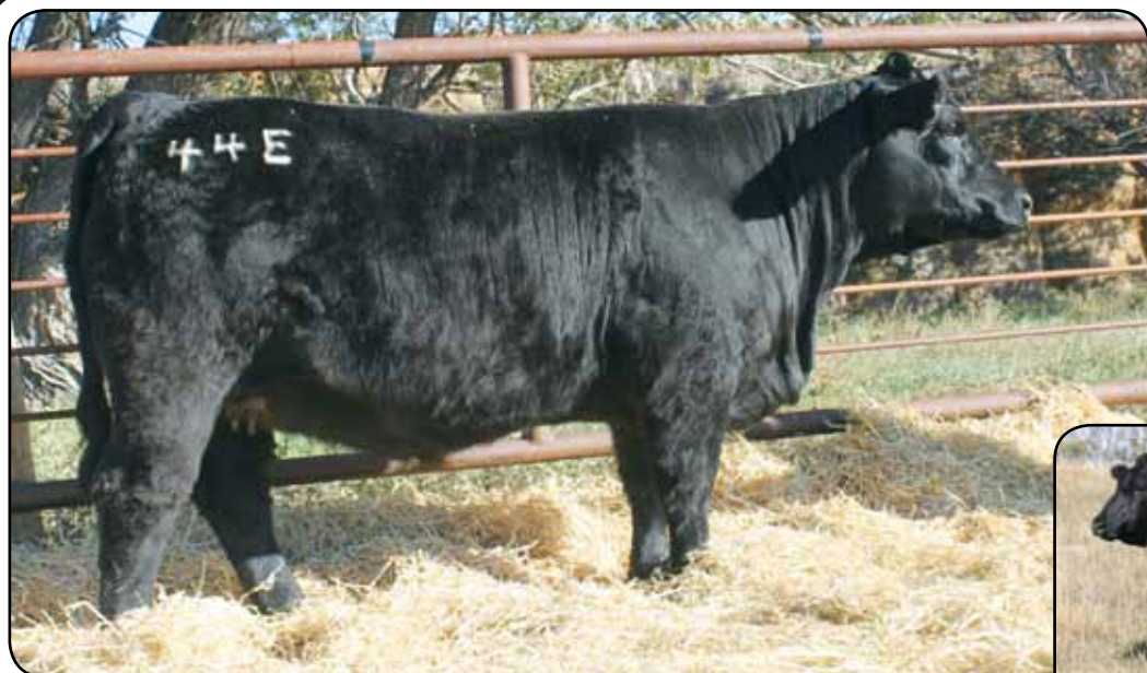
X-T Miss Destiny 73K