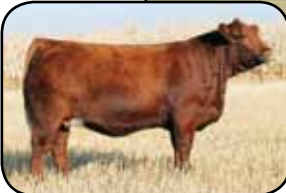
paternal sibling Erixon Lady 56D