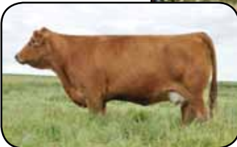
granddam Erixon Lady 2P