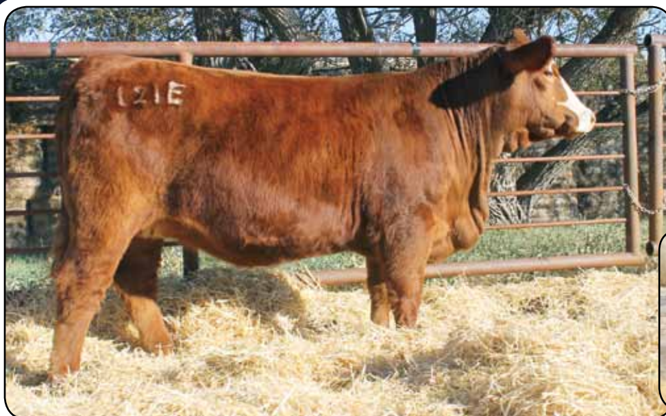
IPU Red Zone 16A