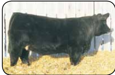
sister to dam