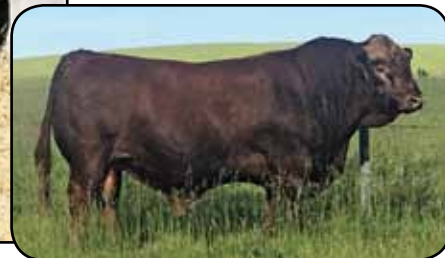
OVHF Tribute 138E

RUST BULL 66Z OVHF TRIBUTE 138E KOP MS CROSBY 2Z X-T RED BODACIOUS 3B SUNNY VALLEY KASSIE 58D SUNNY VALLEY KASSIE 84Z