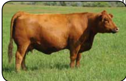
Ultra Miss Carey 44D

LFE BLOOD RUSH 833A LFE AMBER JACK 385E LFE RS SHEILA 152B