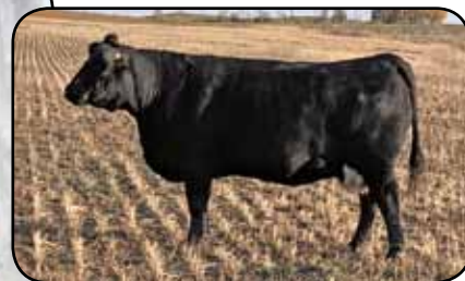
Sunny Valley Kassie 58D