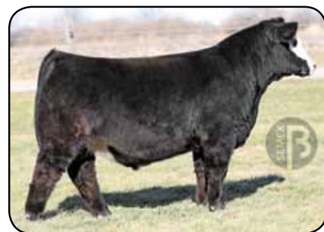
LLW Card True North G71

FBFS WARSAW 068W WELSHS ROSIE 102W SKORS BLACK ENTICER 287Y HART MISS X534 NCB COBRA 47Y PHEASANTDALE MS 124T TNT TANKER U263 PHEASANTDALE MS 87W