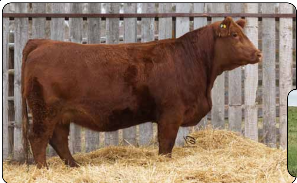
Crossroad Warrior 131F