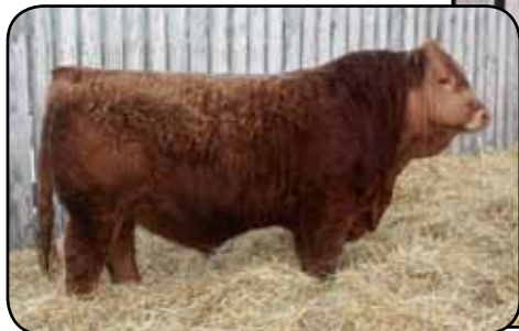
Sunny Valley Deputy 68F

IPU RED DEPUTY 25C SUNNY VALLEY DEPUTY 68F SUNNY VALLEY HOT TOPIC 24D