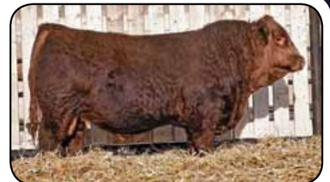
NUG Landmark 310G