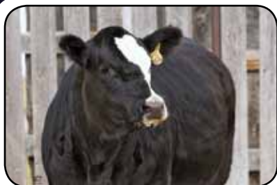
Fairview Sherman 61H