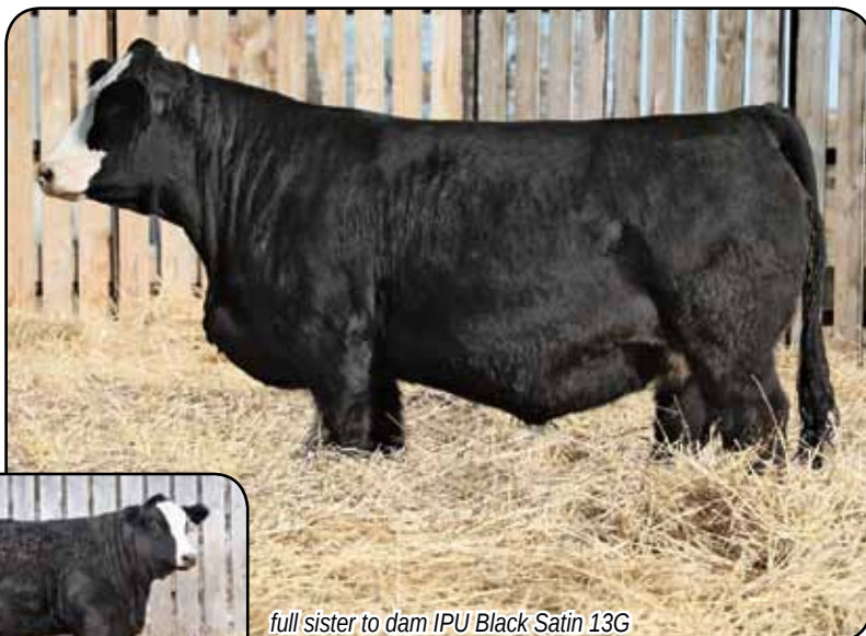
full sister to dam IPU Black Satin 13G

A beautiful, thick made Wheatland Bentley daughter out of a black baldy Priority daughter whose full sister sold in our 2020 Bull Sale for $30,000 to KT Ranches. The D Bar C Black Satin cow family has been very good for us in our black program. When we sold the old original Satin cow she was 12 or 13 years old and still had a perfect udder and she has passed that on to her daughters. This baldy Bentley heifer is an eye catcher, is thick made and easy doing, has a great cow family, and is mated early to the Skor's High Roller bull. We've been so impressed with the High Roller progeny we've seen around the country. At the WLB Dispersal last year, the High Roller group of bred heifers were exceptional and the high seller was a High Roller daughter. The 159H heifer will be homo polled tested by sale time.