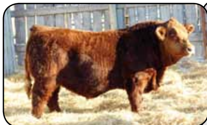
full brother Sunny Valley Gambler 84G