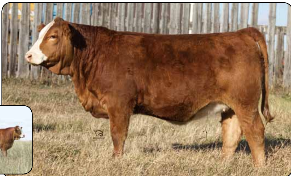
Springcreek Mistress 111C