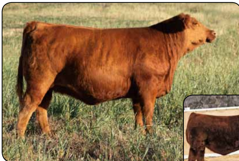
Wheatland Affinity 8196F