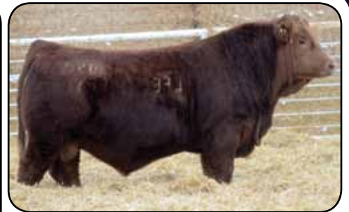
LFE Fortress 850F

maternal brother to sire, LFE Hallpass 851G