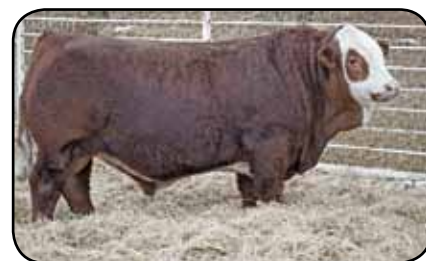
SBV Reputation 707F Fairview Payroll 19D