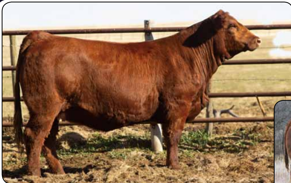
WS Epic E152