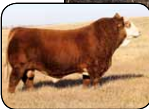
Sunny Valley Canon 86E

A really attractive Sunny Valley Canon daughter that is polled-scurred, deep and angular, very nice fronted, and is going to make a really nice cow. These Canon females and bulls are turning out very good. He puts the polled heads on them all, and they have lots of substance, muscle and style. He himself is stylish and heavy muscled. We're really happy with our Anchor D Outlook calves. They come easy, are very dark red and pigmented, and have lots of style and substance. We think this mating with the Canon daughter and Outlook should work very well.