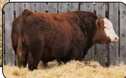
Black Gold Advance 8D

NCB COBRA 47Y BLACK GOLD ADVANCE 8D BLACKGOLD MS ADVANCE 48B