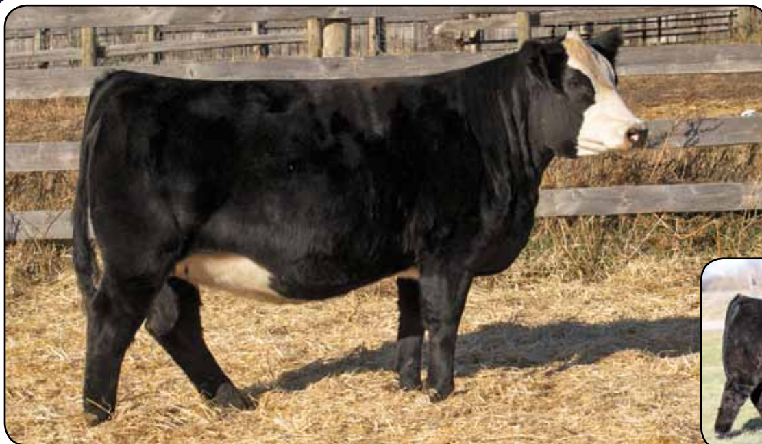
LLW Card True North G71