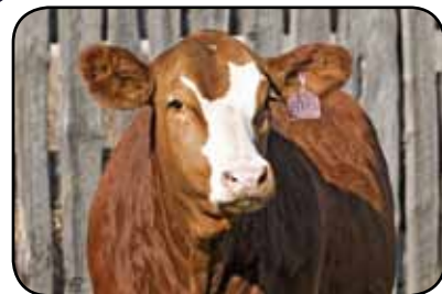
BJL Miss Mia 109D