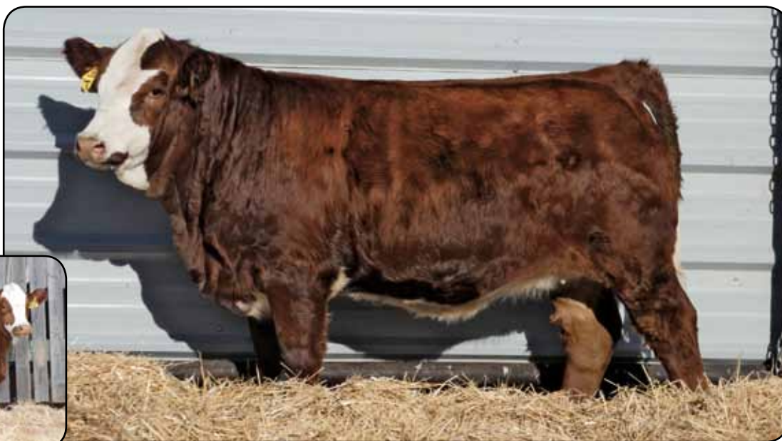
maternal sister DESS Lila 1G