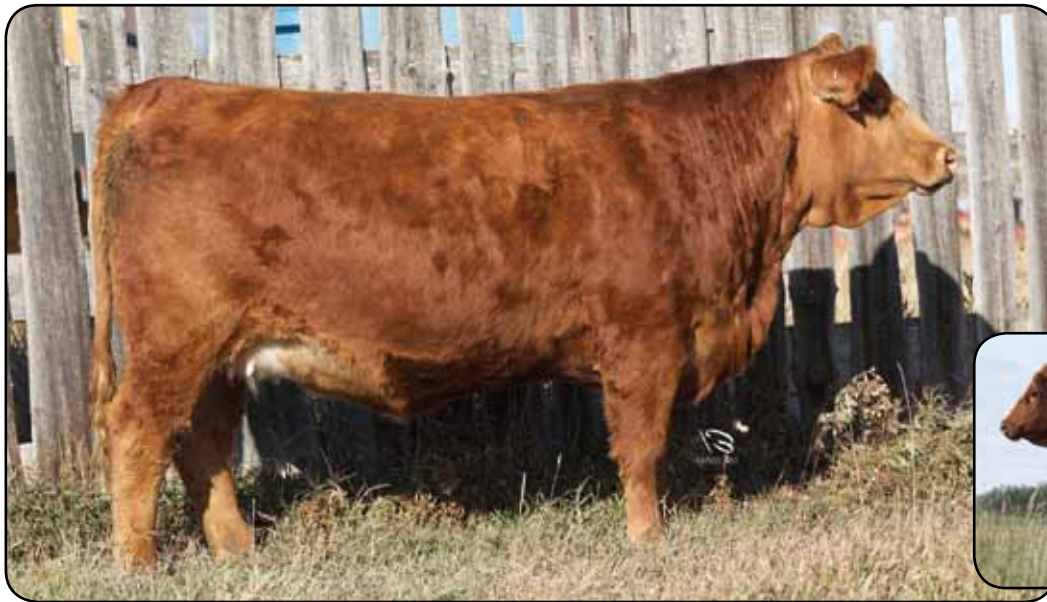
X-T Red Doll 109C