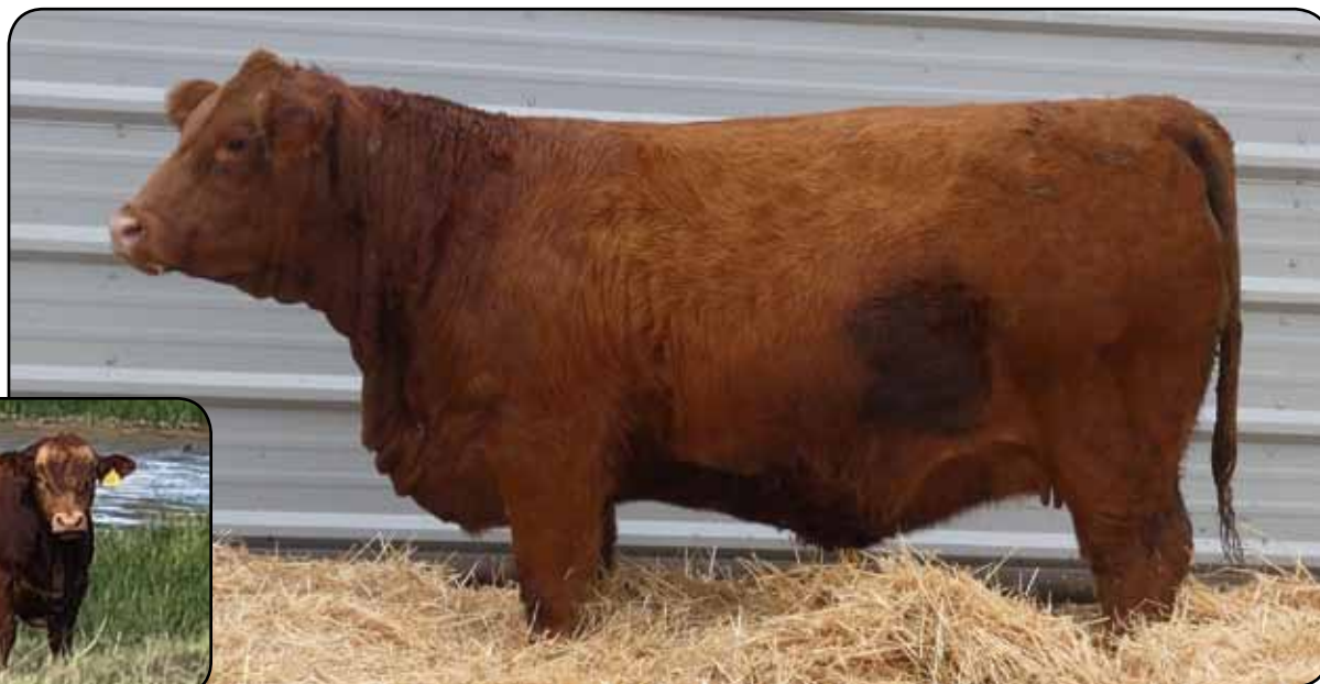
DESS Red Missile 11E