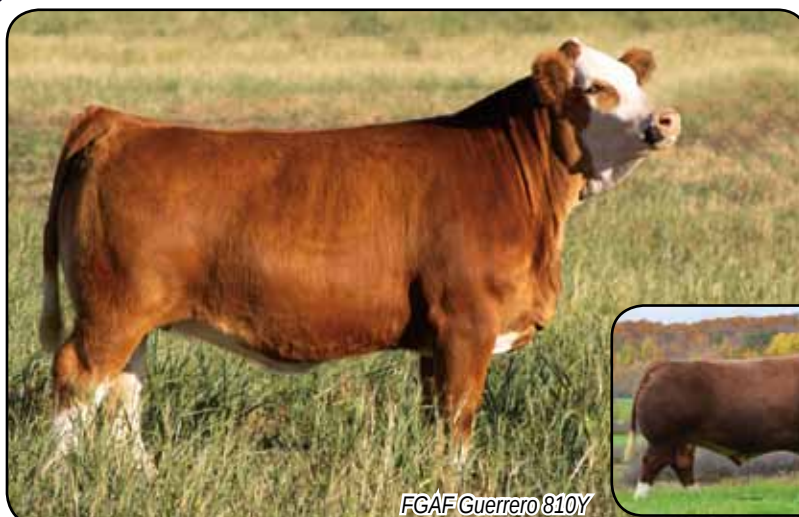
FGAF Guerrero 810Y