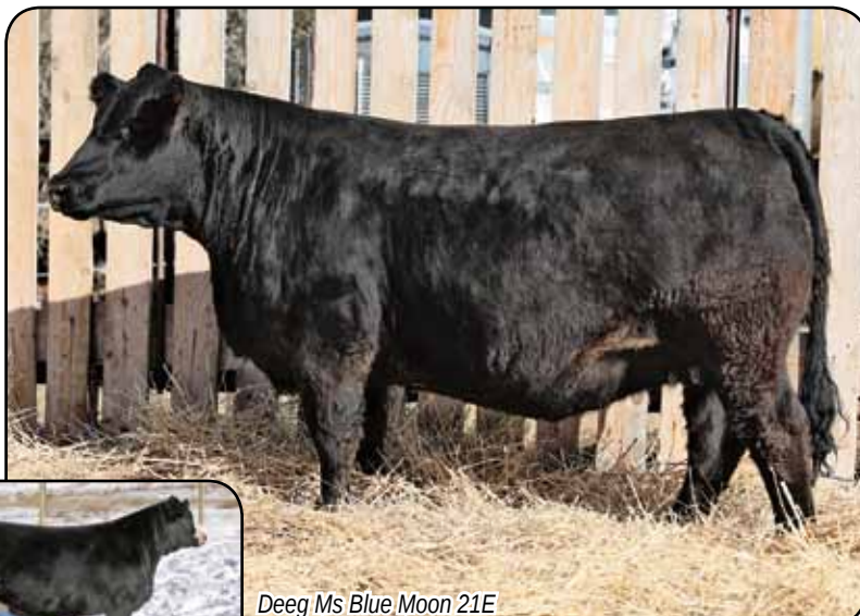
Deeg Ms Blue Moon 21E

Homo polled by parentage. Again a special lot to start out our black section. A Springcreek Liner 56U daughter out of a blaze faced High Idle dam that ourselves and Circle 7 Ranch purchased out of the Friday Night Lights sale from Deeg Simmentals for $32,000 where she was one of the feature lots. We bred her and IVF collected her resulting in five embryos and three full sister Liner 56U heifer calves were born. We sold one in the spring at our bull sale to Stephens Farms, have retained one, and are offering this beautiful 56U daughter in Simmsational 2021. I think the industry knows how good the Liner 56U daughters are and mothered by the exceptional Blue Moon cow, 90H should have a bright future.