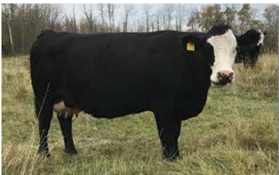
GIDSCO Silks - Dam of Lot 58

Another good baldy heifer that puts it all together. Lots of capacity while still staying very feminine. Excellent udders go back a long way in this pedigree. Another good heifer to build a cow family around.