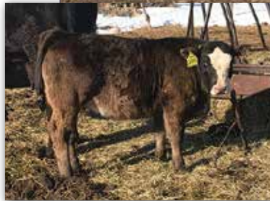
GIDSCO Kiri as a calf.