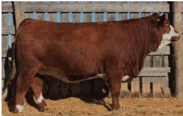
Keet's Harlequin - Dam of Lot 31