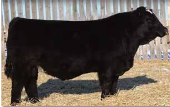
McIntosh Hancock 19J - Sire of Lot 30