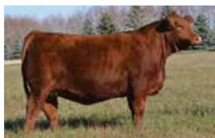
Erixon Trinity 29K Dam of Lot 52