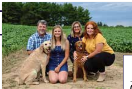
The Brooks Family