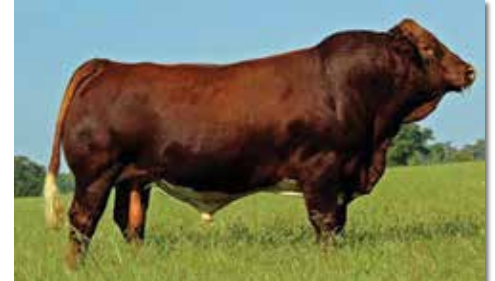
Rugged R Bellagio 5057C - Sire of Lots 19 and 20