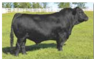
KWA Slider 196H Sire of Lot 52