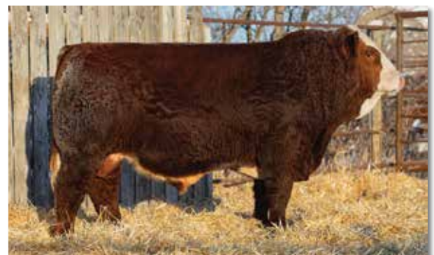
Kuntz North Star 15L - Service Sire of Lots 1 - 4