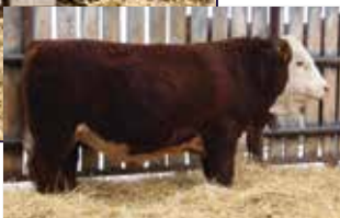
Double G Lottery 61L Service Sire of Lots 24 and 25

Exposed to Double G Lottery 61L April 5-June 9. Observed bred April 5. Preg checked June 12 safe to observed breeding.