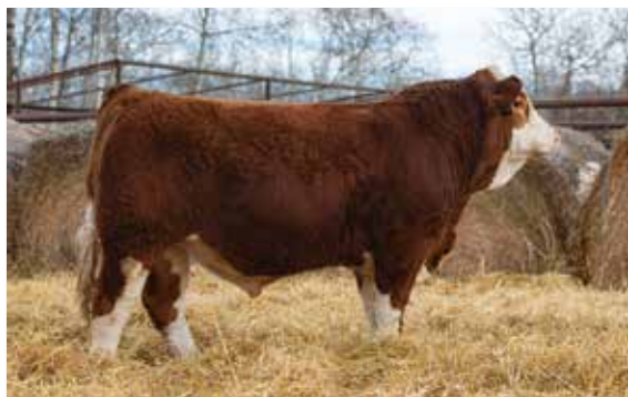
Sinister Lektor 9L - Exposure Sire of Lots 45 and 46