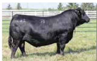
RF Boomer 262K Sire of Lot 51