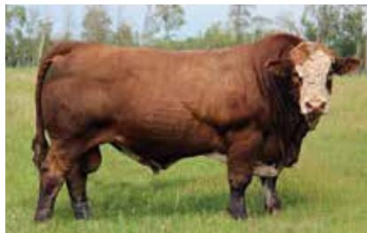
JNR Cashmere Sire of Lot 11