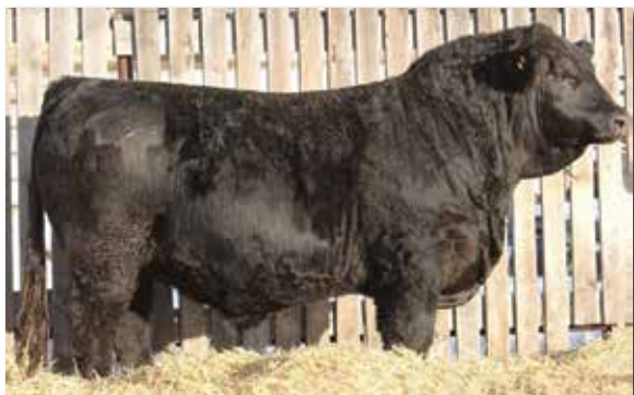
Mader Eagle 509F - Sire of Lot 29