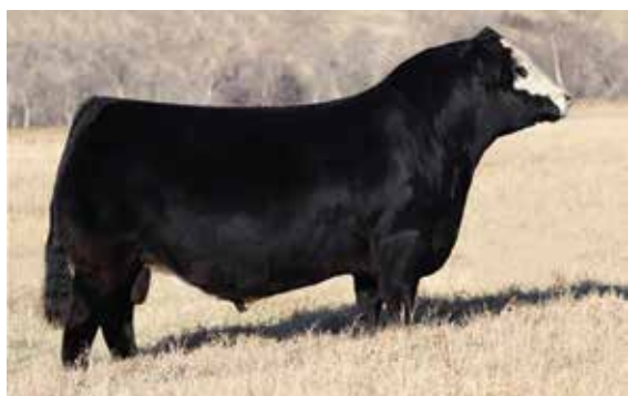
LLW Card True North G71 - Sire of Lot 27