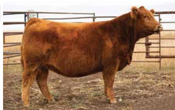
SCSF Ms Red Affinity 6K - Maternal Sister to Lot 43