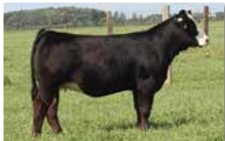
Brooksland Harmony 253H Maternal Sister of Lot 50 Sold to Double Bar D