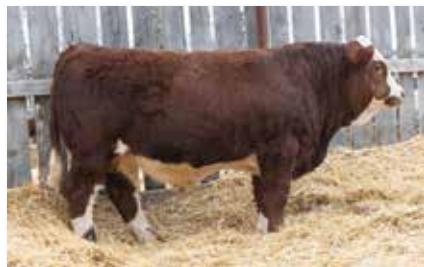
J-Bar Kayenne 23K Sire of Lot 55

Spring Creek 20M is off a beautiful black blazed face first time calver. She did a great job raising this calf! She was new to the farm last fall and fits right in. I really try to focus on great udders and feet and she has both going for her. Her sire is a fancy full blood with great numbers.