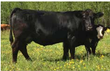
GIDSCO Boa - Dam of Lot 57

A really good War Paint female out of a cow that always puts a bit of extra shape and thickness in her calves. You will have to see her in person to appreciate her capacity and thickness. Picture really doesn't do her justice. IMO could be a start of a good cow family.