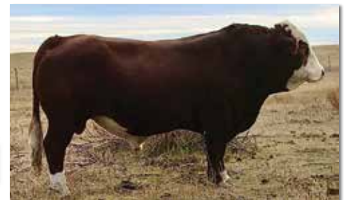
Anchor D Fabulous 245H - Sire of lot 24 - Service sire 19-21,23