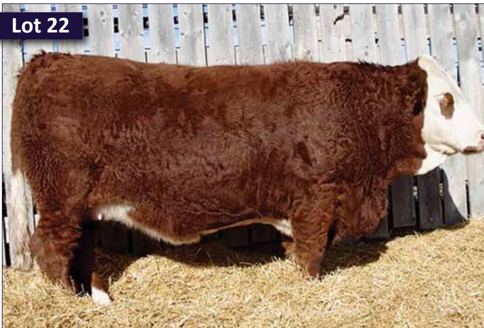
Kindred Spirit Glasgow 8D - Sire of Lot 22