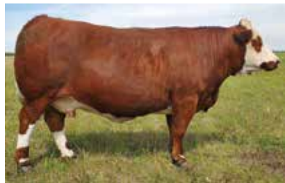
KEET'S Yesenia 40Y Dam of Lot 11