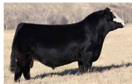
LLW Card True North G71 - Service Sire of Lot 47