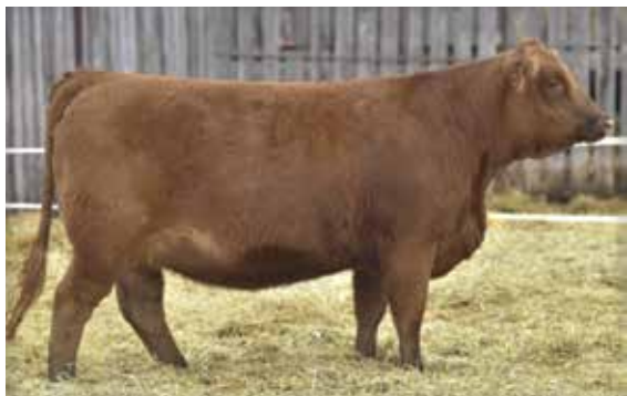
Blacksand Fearless 5A - Dam of Lot 28