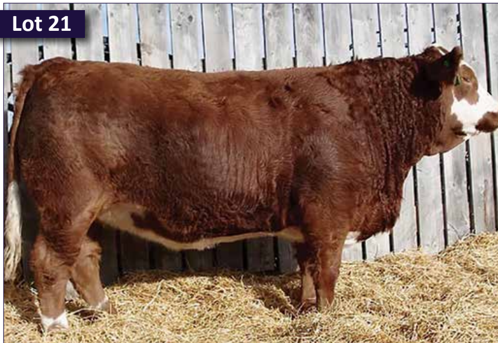
Kindred Spirit Helios 30H - Sire of Lot 21