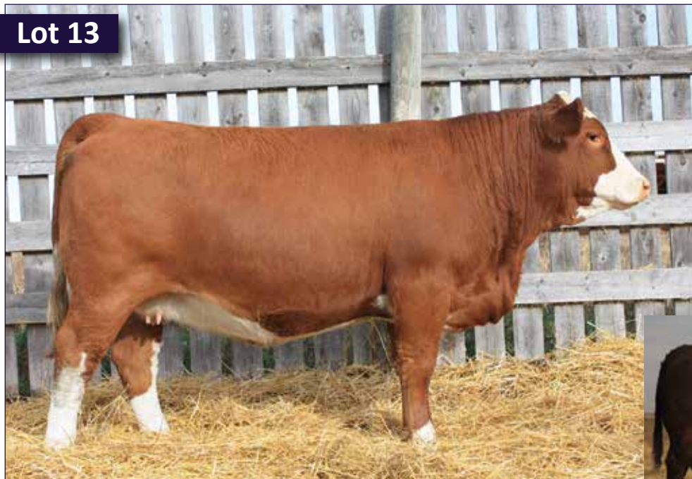
Fairview Evolution 318H - Sire of Lots 13-18

100% Fleckvieh. Homozygous Polled. Diluter Free.