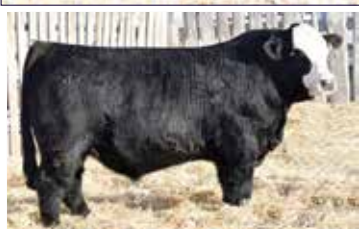
Circle G Keon 11K Sire of Lot 56

Spring Creek 22M is from heifer we bought last year at this sale from the great folks at Triangle 33 Simmentals. It is hard to see this one leave the farm, she has caught my eye from day one with her sound personality and feminine looks! She's a sweetheart.