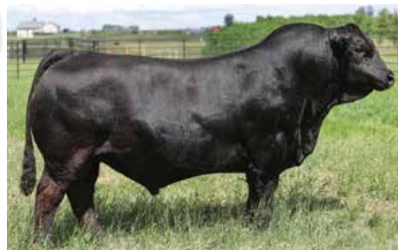
R Plus Mandate 1044J - Sire of Lots 37 and 38