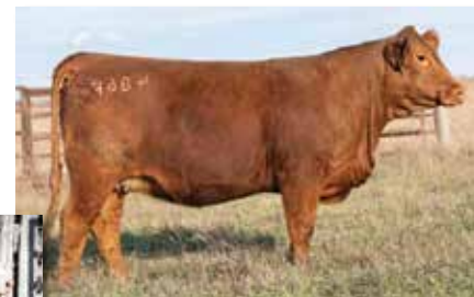
Double Bar D Unique 486F - Dam of Lot 48

TCC Mr Gilmour 2M Half Sibling of Lot 48