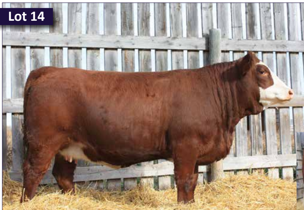
Clearwater HP Knox 61K - Service Sire of Lots 11-18

100% Fleckvieh. Homozygous Polled. Diluter Free.