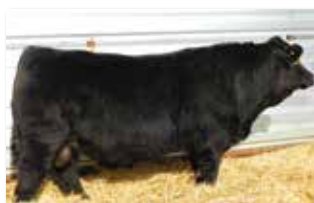
LTS Superb 2006K Maternal Brother of Lot 51