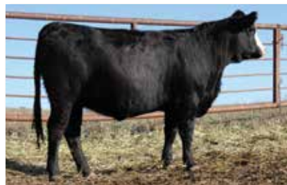
Lakeview Kallie 17K Dam of Lot 55