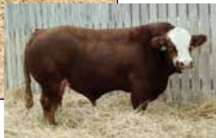
Kindred Spirit Ezana 1C Sire of Lot 25 - Service Sire of Lot 22

Exposed to Double G Lottery 61L April 5-June 9. Observed bred April 5. Preg checked June 12 safe to observed breeding.