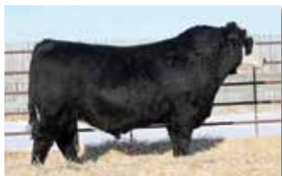
Double Bar D Bankroll 804F Sire of Lot 50