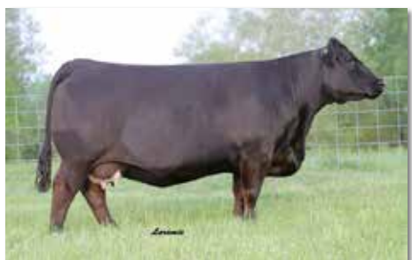
Onyx 451W - Dam of Lot 49