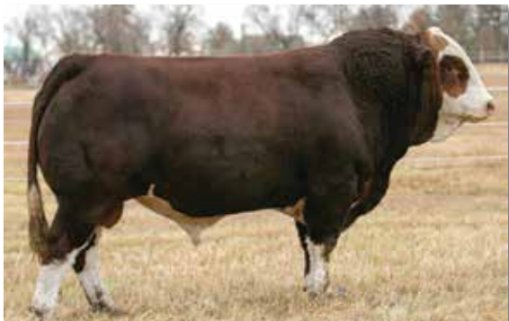
SVS Gambler 33H - Service Sire of Lots 45 and 46