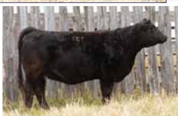
T33 Ms Katrina 20K Dam of Lot 56