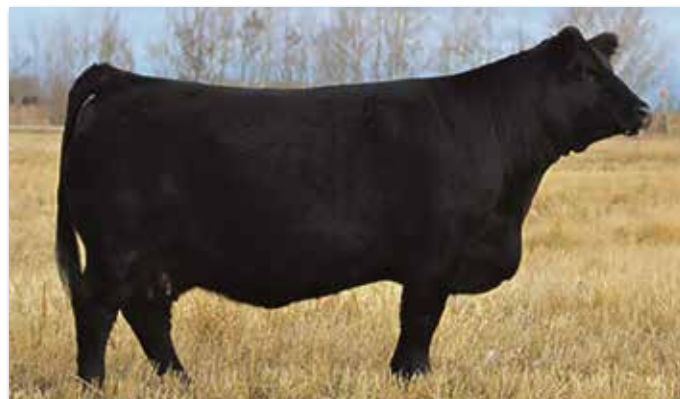
MAF CF Tara 188D - Dam of Lots 40 and 42

Bringing out the very best is just what we have committed to do for this prestigious event. Tara's Louelle 46L may just be our best effort to date! I contacted the Aumack's after their purchase of Kindred Spirits Helios 30H. I wanted to try a flush of Tara to a high quality homo polled full blood and 30H was an easy choice. After harvesting only 3 embryos and implanting them Louelle was the only catch we had. She is long bodied, powerful, has tons of volume and rib shape with a perfect foot. Her beautiful udder development along with her unique pedigree make her a true foundation female prospect. On her face she wears a nice snipe "7" being the only chrome on her.